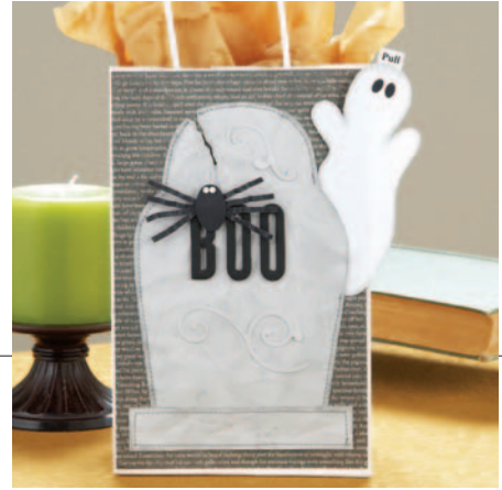
Tombstone Cut 1 from Grey cardstock