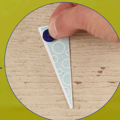
Adhere quilled piece to project.